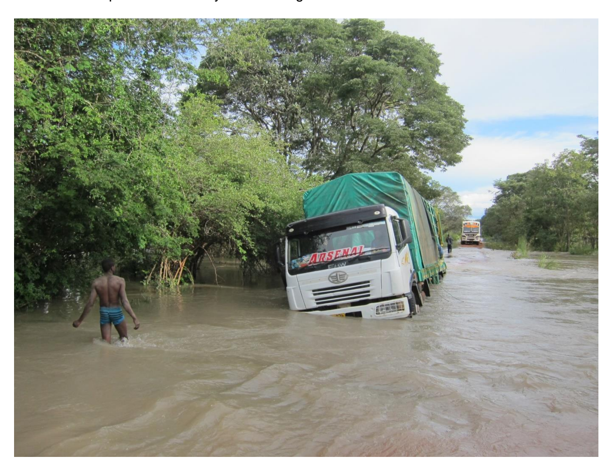
Fig. 1. The high water level of Kululu River made the crossing by car impossible.

The mushroom study will be completed by a forest study during the next dry season. In addition, a similar mushroom study is foreseen by ADAP in the Mlele Forest Reserve which could also complement the study for the Rungwa corridor.