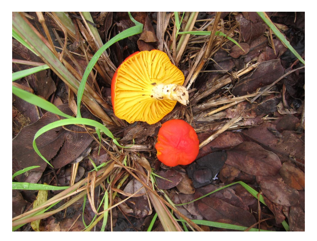
Fig. 4. Two-coloured Cantharellus platyphyllos nearby Wembele hunting camp.