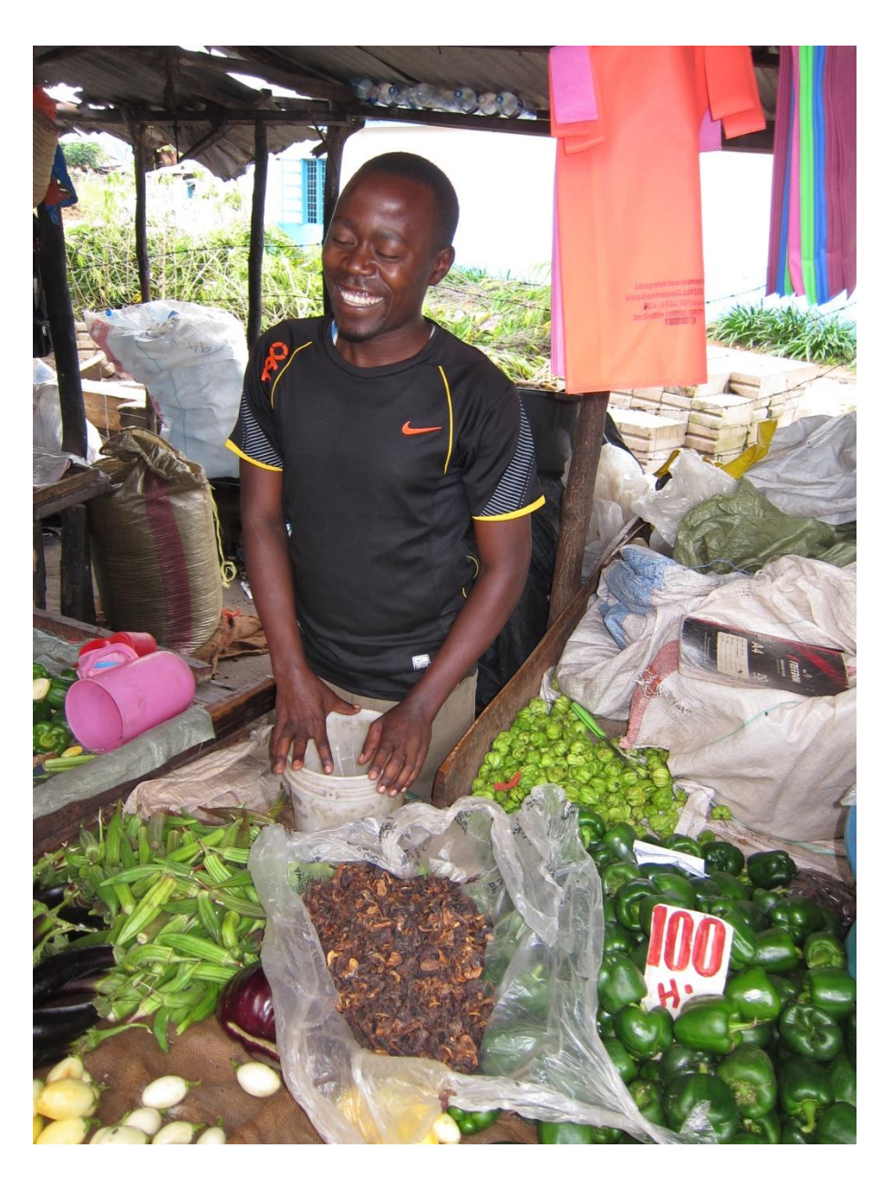
Fig. 6. Selling of Cantharellus isabellinus ( Lactarius sp.) at Town Clinic market in Tabora