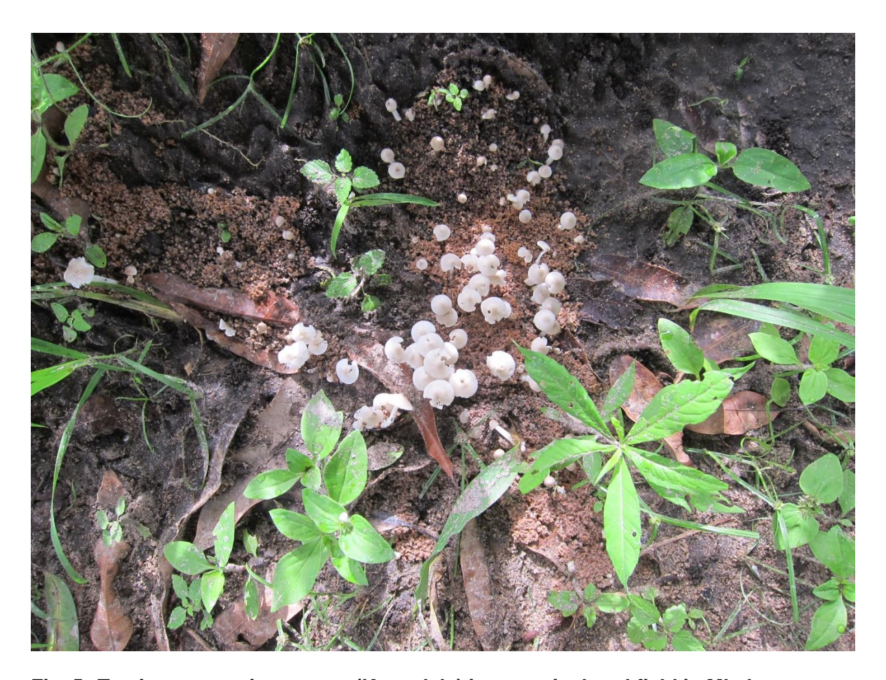
Fig. 5. Temitomyces microcarpus (Kansolele) in an agricultural field in Mkola.