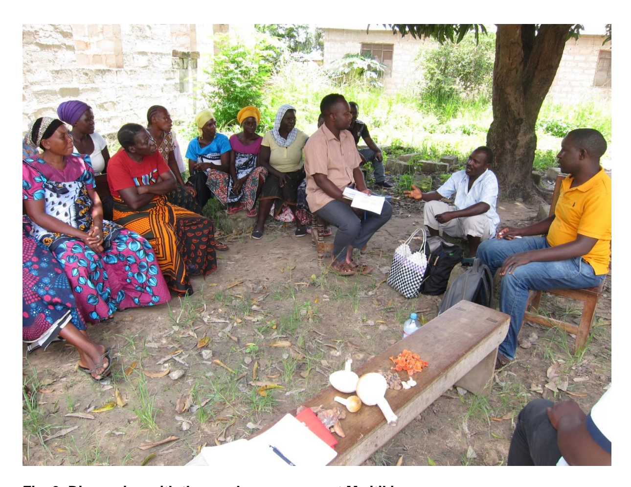
Fig. 3. Discussion with the mushroom group at Mwitikio.